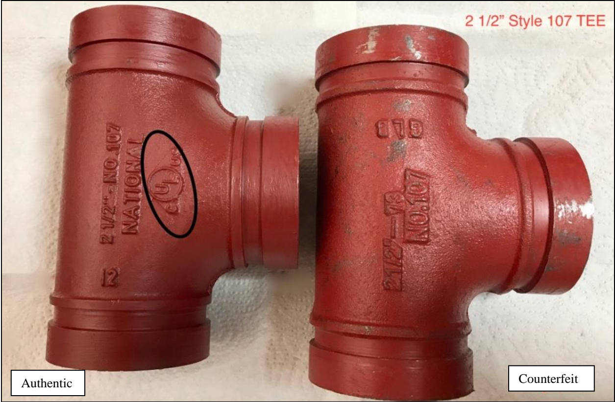
Figure 4. Comparison of an authentic National Fittings 2 1/2" grooved tee (left) to one of the counterfeit 2 1/2" grooved tee (right) bearing a counterfeit FM Approvals marking

Figure 4 shows the reverse side of the same grooved tees (counterfeit on the right and authentic on the left) shown in Figure 3. While the counterfeit tee bears the same size and model marking as the authentic, it does not show the manufacturer mark on this side like the authentic tee.