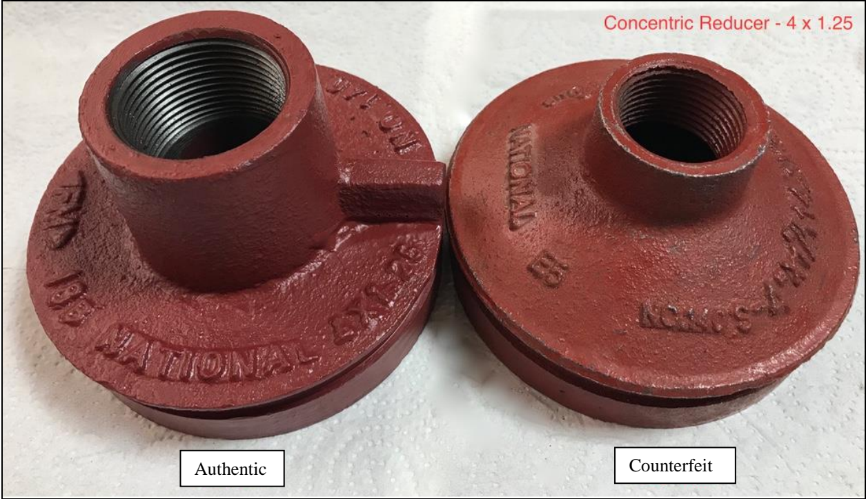
Figure 5. Comparison of a counterfeit 4" x 1 1/4" reducer (right) with an authentic National Fittings 4" x 1 1/4" reducer (left)

Figure 5 shows an authentic National Fittings concentric 4" x 1 1/4" threaded reducer fitting at left next to a counterfeit version of the same fitting at right.