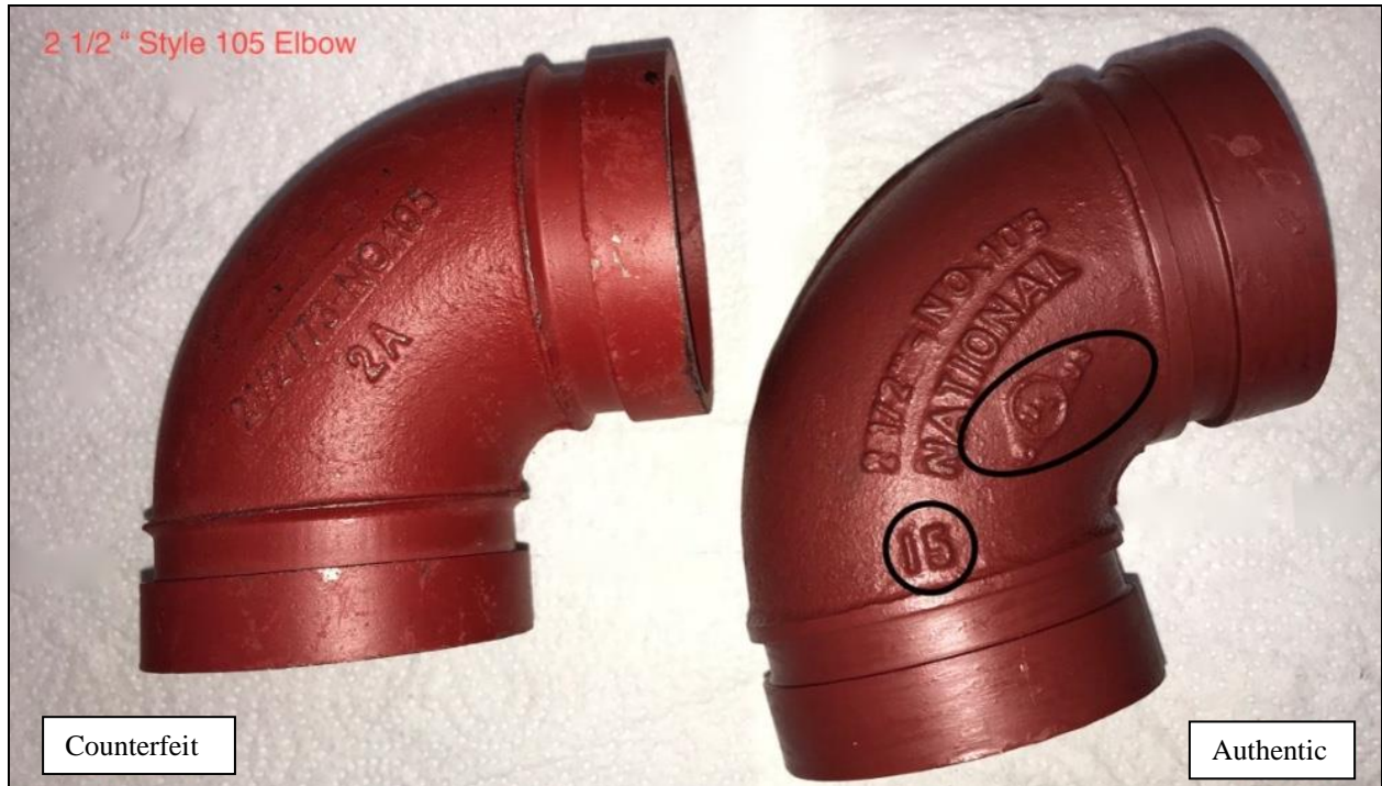
Figure 2. Comparison of a counterfeit 2 1/2" elbow (left) and an authentic National Fittings style 105 2 1/2" grooved elbow (right).

Figure 2 shows the reverse side of the same grooved elbows (counterfeit on the left and authentic on the right) shown in Figure 1. While the counterfeit elbow bears the same size and model marking as the authentic, it does not show the manufacturer mark on this side like the authentic elbow.