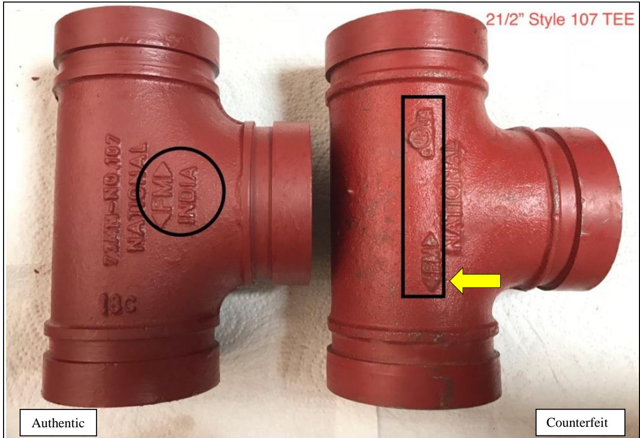
Figure 3. Comparison of an authentic National Fittings 2 ½” grooved tee (left) to one of the counterfeit 2 ½” grooved tee (right) bearing a counterfeit FM Approvals marking (highlighted with arrow)

Figure 3 shows a counterfeit grooved tee, 2 ½” NPS (at right) that resembles the authentic Style 107 grooved tee manufactured by National Fittings (at left). While the counterfeit shows the “NATIONAL” manufacturer mark, only the authentic elbow bears the location of manufacture “INDIA.”