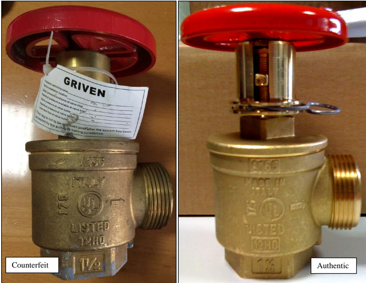
Figure 2 - Profile view of counterfeit valve (left) and authentic Giacomini A156 valve (right)

Figure 2 below shows the opposite profiles of both the counterfeit valve (left) and an authentic Giacomini valve (right). The model designation used on the authentic Giacomini valve, "A156," also appears on the body of the counterfeit valve. The manufacturing location of authentic Giacomini valves, "ITALY," is also cast into the counterfeit valve body, although on the authentic valve the full phrase reads "MADE IN ITALY."